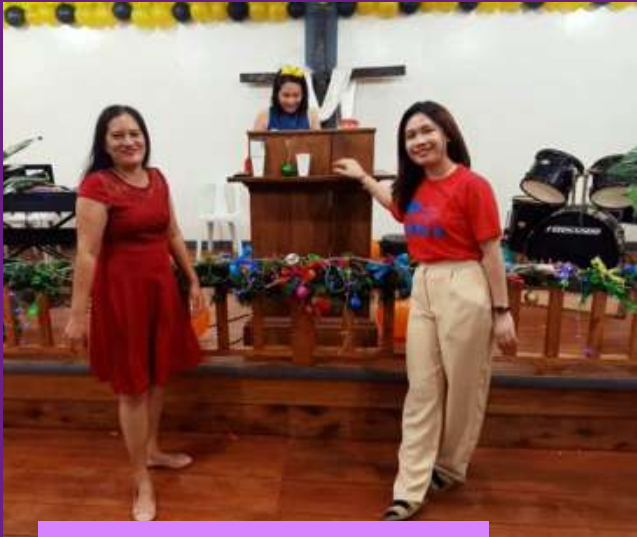
Memory verse recitation