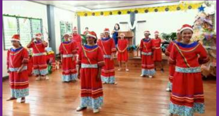
Lacolac church women wearing tribal costume for their presentation