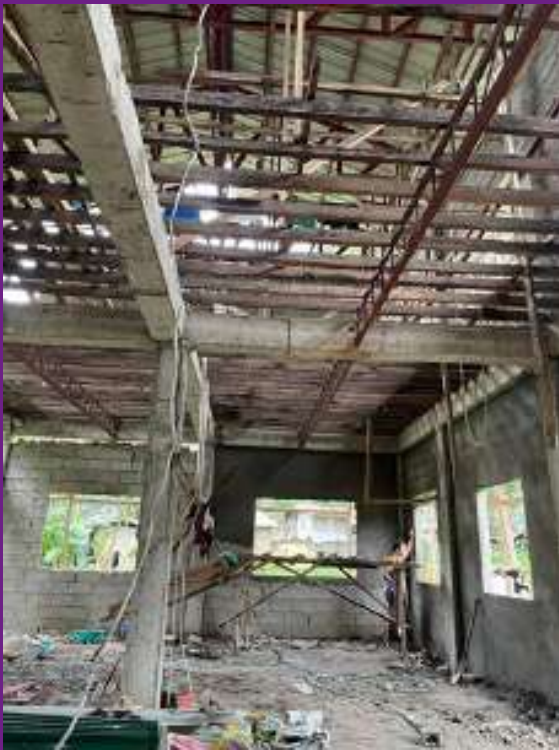
Ongoing church building construction in El Salvador City