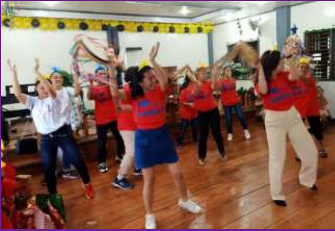
Lacolac Church ministry volunteers presenting a special number