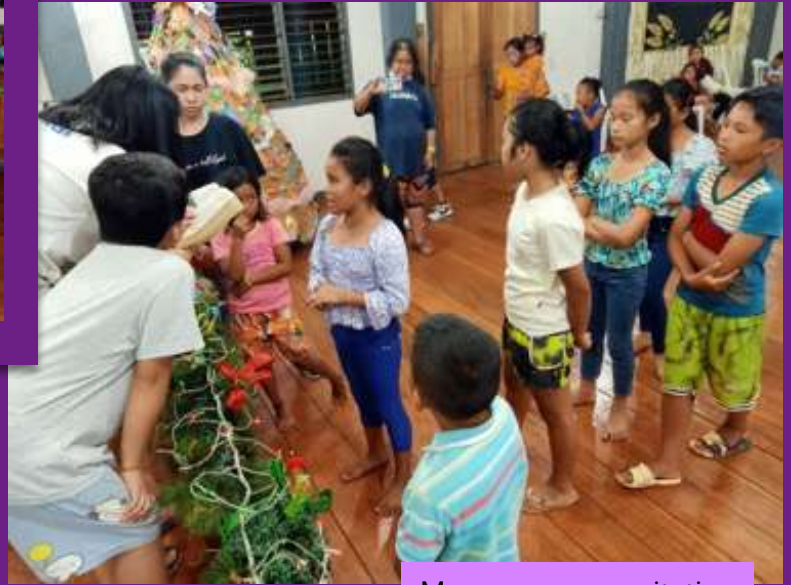
Memory verse recitation during Christmas children's party