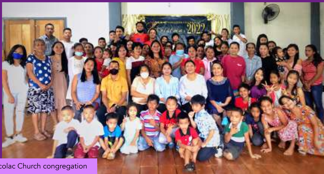
Lacolac Church congregation

One of the things that gave us particular joy was a testimony given by a member of the Zamboanga City Church whose response to the Sunday service sermon went something like this: “For us, the truth from God’s word we have received and learned is more than any material gift we could be given” .