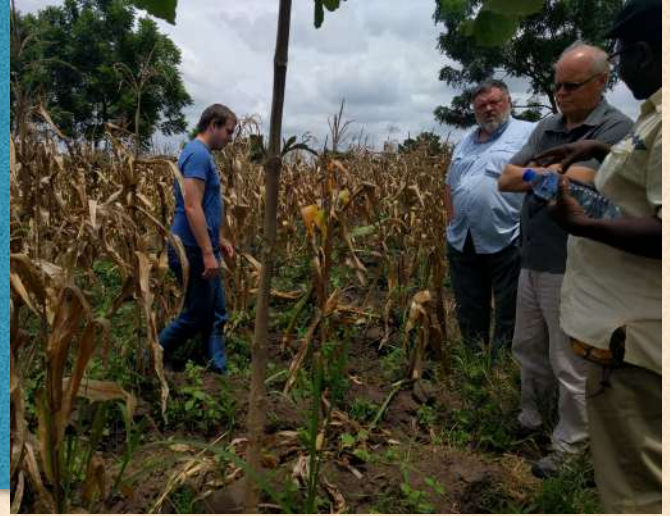
Macklann discussing food crops and harvesting