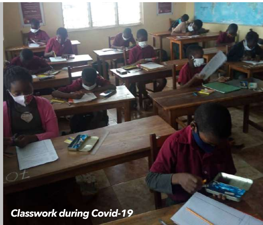
Classwork during Covid-19

School has started for all national exams classes. 5th, 9th, 11th and 12th graders will go through exams to be able to pass to the next level. Since we have 5th grade with 14 children at our school, we have 6 weeks of class before their exams in August.