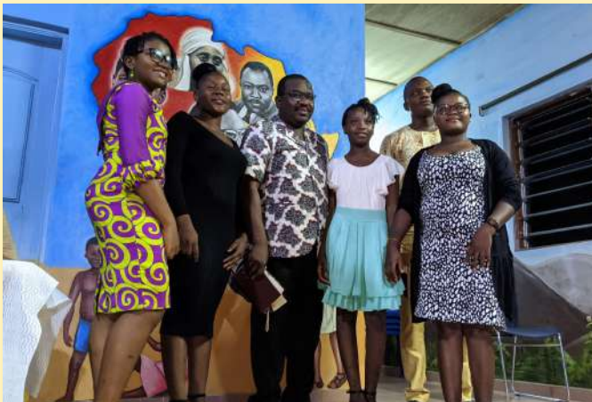
Online Worship Team