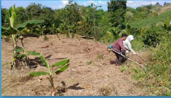
Work for food program: time to cut all the weeds

Under the work for food program , much work is going on in the farm. The weeds and parasite vines grow way faster than the plants. And they have a way of wrapping themselves around the branches, choking them, rendering them unable to bear fruit, and ultimately killing the branches. We are speeding up the work before the rainy season, before the weeds can grow back up fast.