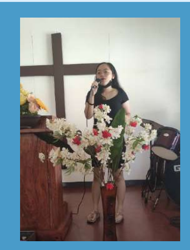
Public profession of faith of one of the ten participants of the recently concluded church membership class